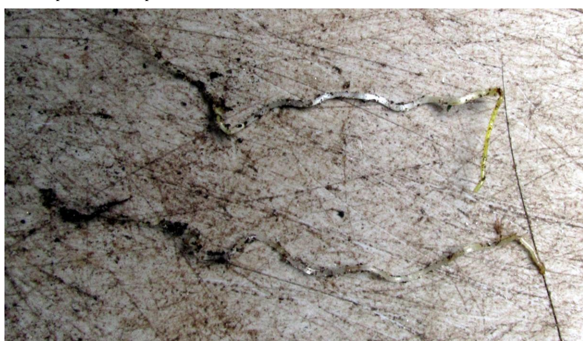
account when deciding how deep in the compost we should sow the seeds.

Above is one such trial using Erythronium sibiricum where the seed in the large pot was surface sown and germinated well – I sowed the seed in the other pot deeply and like all my other trials I got no signs of germination. The failure of the deeply sown seed to germinate has puzzled me for years challenging my hypothesis- I had failed to take into account that all Erythronium seedlings come through the ground bent over, shepherd's crook fashion, and not pointed-end-up like those of Narcissus, Crocus, for instance, which also have elaiosomes.