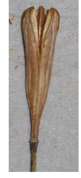
Type 1 seeds and capsule

As the seed capsule ripens it opens from the top to less than a third of the way down so the top seeds fall out easily while the lower ones remain in place until the capsule is agitated in some way. Simultaneously the stem also dries becoming springy so that when it is shaken by the wind or other physical movement it acts like a not very efficient catapult releasing more seeds - this is a very inefficient form of seed distribution because some seed may even be retained for months until the capsule eventually disintegrates. I have measured the distance that the seed can be catapulted and 2 metres is the best distance I could achieve with a good pull on the ripe stem. If we take an optimistic five years for that seed to then germinate and reach flowering size before it can shed its seed another 2 metres we can work out, if all the conditions were favourable, that it would take at least 250 years for the plant to extend its range by 1km. Any geographical barriers such as rivers or rocky barren ground would restrict the distribution of a plant with such an inefficient method of spreading its seed. These factors go a long way to explaining why so many of the Western North American Erythronium species have very restricted distributions in the wild, before we even consider other factors such as habitat and climate.