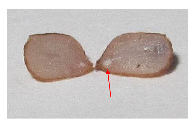
Sectioned seed showing the white embryo, near the pointed end, surrounded by a starch food supply.