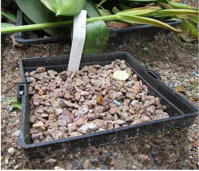
Erythronium sibiricum seedlings

Above is one such trial using Erythronium sibiricum where the seed in the large pot was surface sown and germinated well – I sowed the seed in the other pot deeply and like all my other trials I got no signs of germination. The failure of the deeply sown seed to germinate has puzzled me for years challenging my hypothesis- I had failed to take into account that all Erythronium seedlings come through the ground bent over, shepherd's crook fashion, and not pointed-end-up like those of Narcissus, Crocus, for instance, which also have elaiosomes.