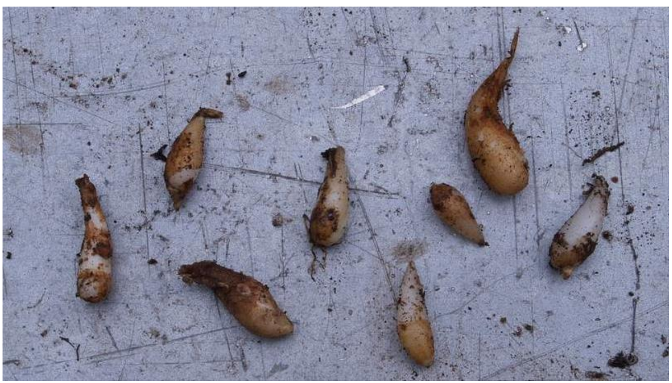
First year bulbs

Keep the seedlings growing as long as possible making sure that they never dry out while in growth. Apply quarter strength, tomato type (higher in K than N), liquid feeds at two week intervals to help build the young bulbs. You should find that seedlings can keep growing much longer than mature plants and will often grow until August if kept cool, moist and well fed. An extra few weeks' growing time now can save a year on the time it takes to get a flowering sized plant.