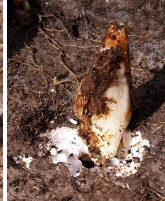
Bulb pushing into polystyrene base.

After five years you will find most of the bulbs have made their way to the bottom of the box, some even push through the polystyrene trying to get ever deeper – in extreme occaions I have to break the polystyrene box to recover the bulbs that are lodged in the base.