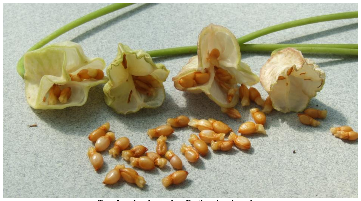
Type 2 seed and capsules - Erythronium japonicum