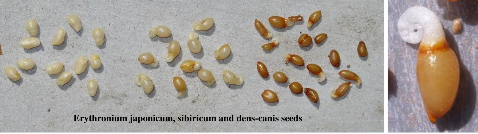
Type 2 – the other dispersal strategy within Erythronium seed is shared by both the Eastern North American and the Eurasian species which have evolved an insect/ant aided strategy. The ripe seed capsule of this type opens much wider at the top allowing the seed to spill out very easily – the stem often bends placing the capsule on the ground.

The seed of all these species possess an elaiosome, a fleshy appendage attached to the seed, evolved to attract ants or other insects to gather the seed to enjoy this tasty morsel in exchange for distributing the seeds over a wide area. With the possibility of flying insects also taking these seeds, the distance the seeds could achieve away from the parent could be considerable and so this is a much more efficient distribution method than Type 1 seeds possess.